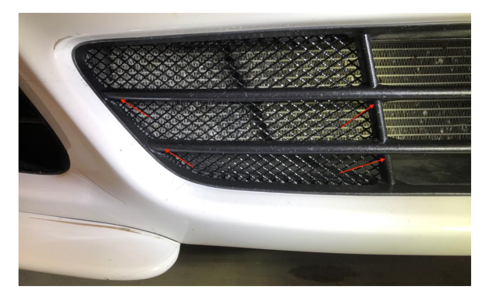
Figure 1. Right end section of Front Center Grille in position.